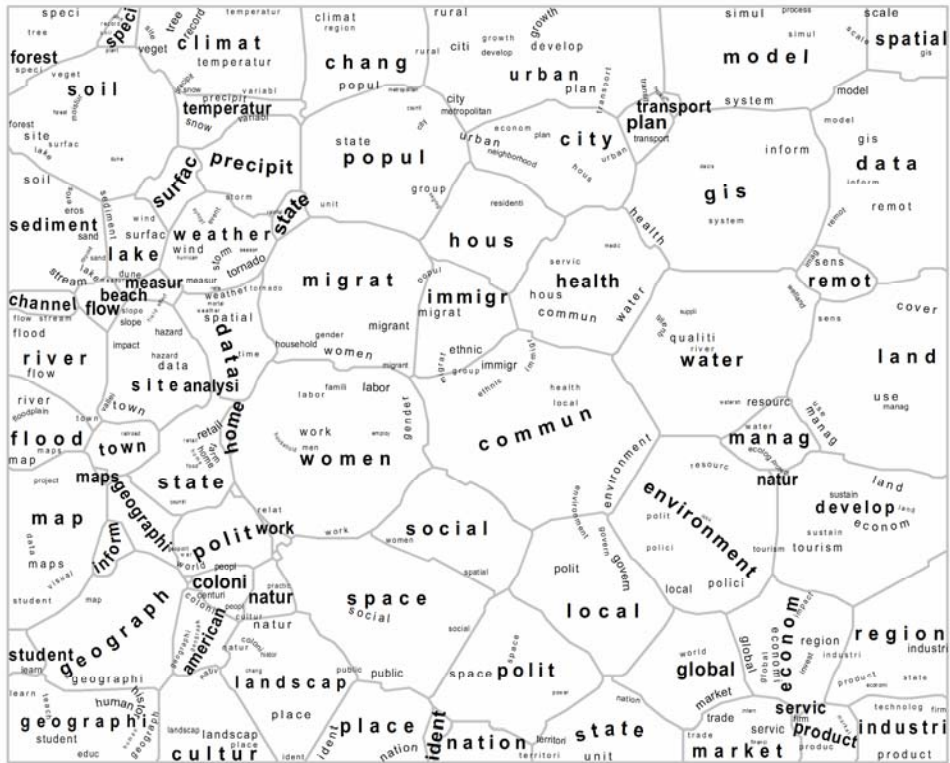
Spatialization_Figure_1: Spatialization of the geographic knowledge domain based on 20,000+ abstracts submitted to the Annual Meetings of the Association of American Geographers (AAG).