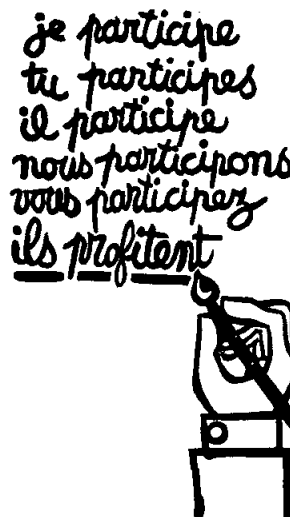
FIGURE 1 French Student Poster. In English, I participate; you participate; he participates; we participate; you participate . . . They profit.

There is a critical difference between going through the empty ritual of participation and having the real power needed to affect the outcome of the process. This difference is brilliantly capsulized in a poster painted last spring by the French students to explain the student-worker rebellion. 2 (See Figure 1.) The poster highlights the fundamental point that participation without redistribution of power is an empty and frustrating process for the powerless. It allows the power-holders to claim that all sides were considered, but makes it possible for only some of those sides to benefit. It maintains the status quo. Essentially, it is what has